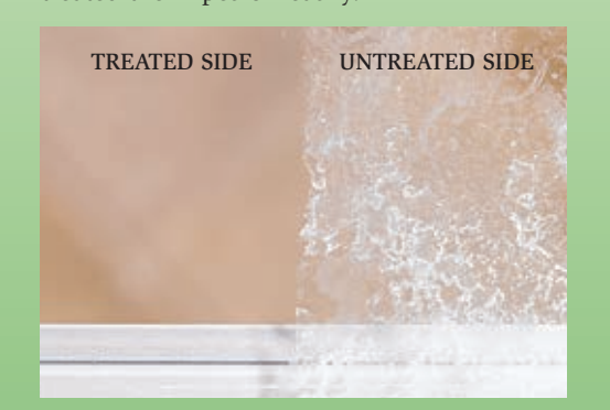
Treat Your Glass: DIAMOND SEAL SYSTEM-treated glass stays cleaner, optically clearer and resists the damage caused by harsh chemicals and environmental contaminants.